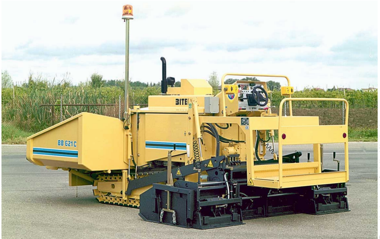
The machine shown can be fitted with additional equipment